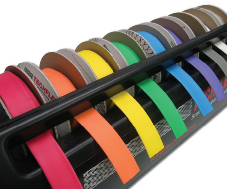
Shrinkflex shop spools fit into our dispenser kit (pg. 119) for easy storage and organization.

When economy is priority, 2:1 Shrinkflex heatshrink tubing is the answer. Not as versatile as a high ratio shrink product, 2:1 will still slide easily over small inline splices and connectors and provide a tight seal in many applications.