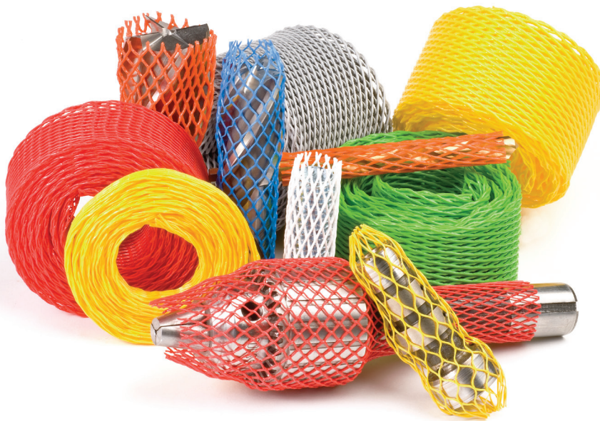
Part Guard protects precision surfaces from damage.

Part Guard is available in an expandable, medium duty type (PGE) or a thicker, non-expandable product (PGN). Each size is defined by a discrete color, allowing quick and easy visual identification of the diameter, and simplifying inventory management of various products.