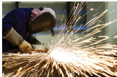
1 (833) SLEEVING www.techflex.com